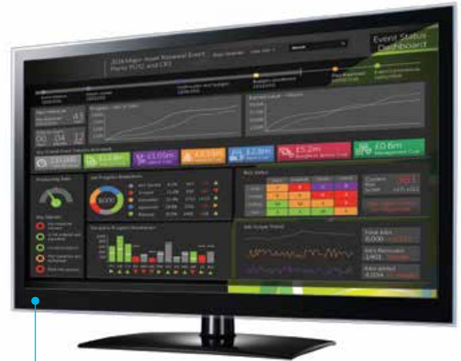
Event dashboard allows its users in a single glance to understand their event progress, risks, spend and productivity. Designed to interact on large interactive touch screens in project management offices and conference rooms.

STO allows the Asset Owner to remain in control and fully up-to-speed with their time-critical events. All information entered into STO is controlled by its proven workflow and accompanied throughout by comprehensive revision history; this enables maximum control. Through the same benefit, STO enables the Maintenance Contractor(s) to safeguard and maximise the value earned from an event.